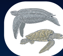
Leatherback and olive ridley turtles