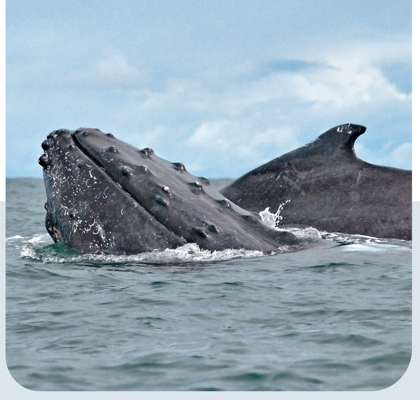
Humpback whale (Megaptera novaeangliae).